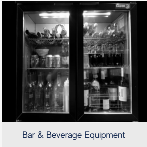
Bar & Beverage Equipment