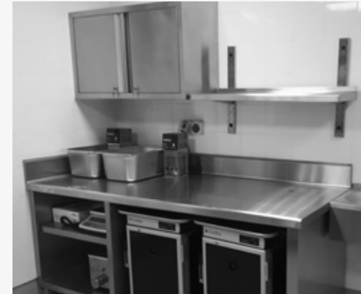
Stainless Steel Fabrication